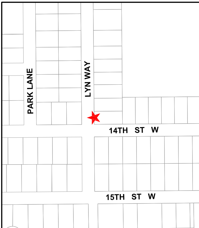
Corner of Lyn Way & 14th St W