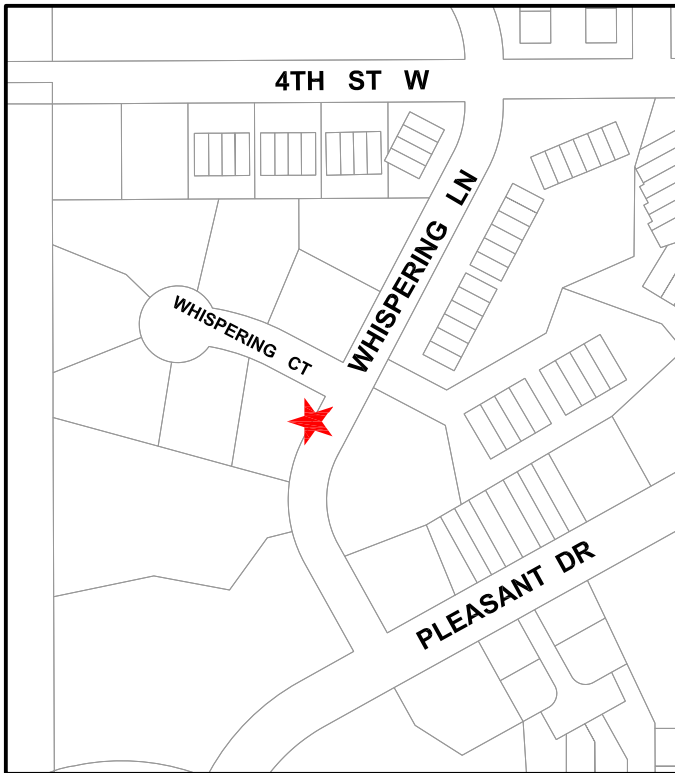
Corner of Whispering Ln & Whispering Ct